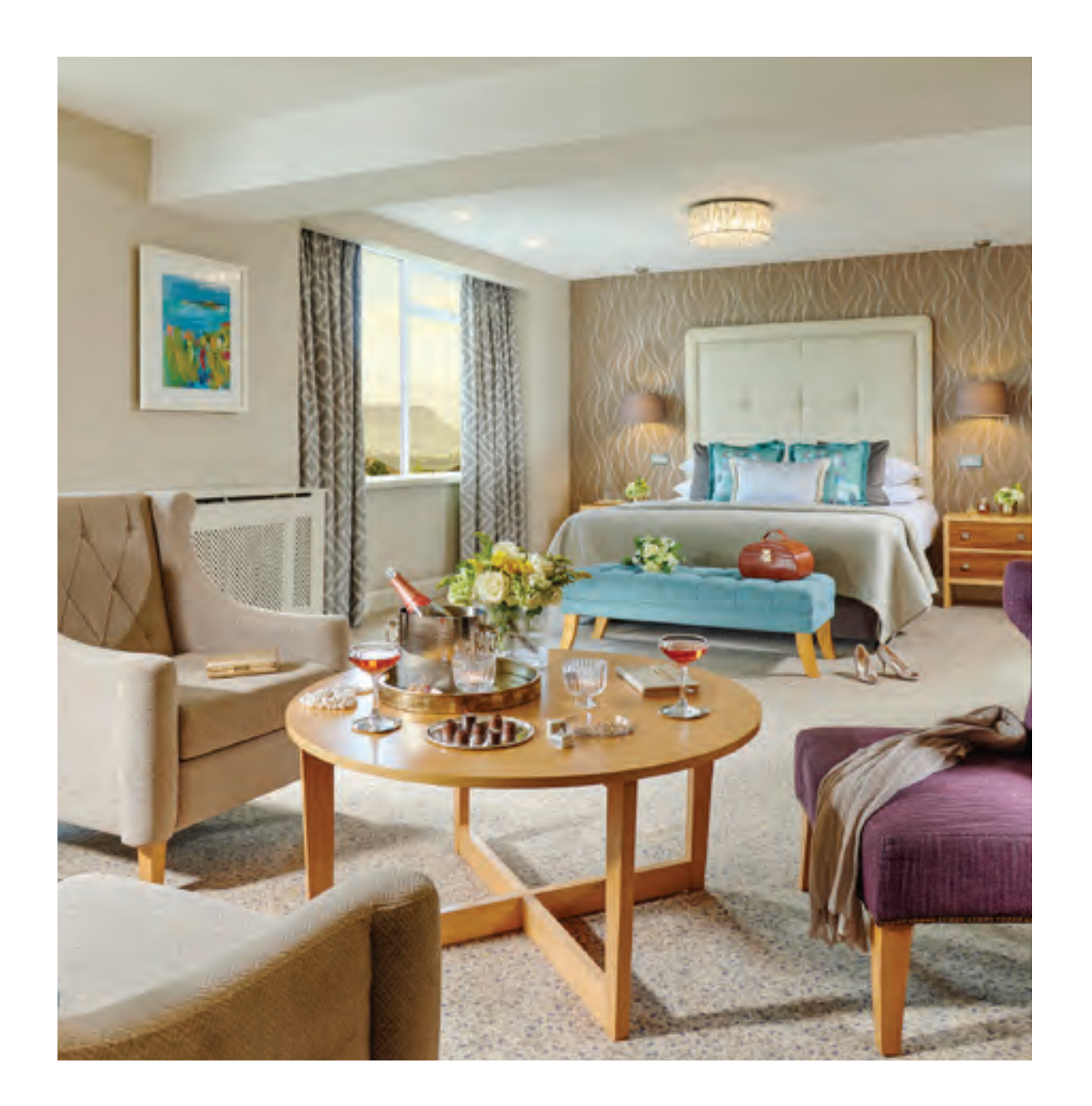
AT THE SLIGO PARK HOTEL

Sligo Park Hotel is located on the Wild Atlantic Way, just on the edge of Sligo Town, in the Heart of Yeats' Country, the Four-Star Sligo Park Hotel is set in quiet parkland and surrounded by some of the most scenic countryside in Ireland, ranging from the majestic Benbulben Mountain to the Wild Atlantic Way.